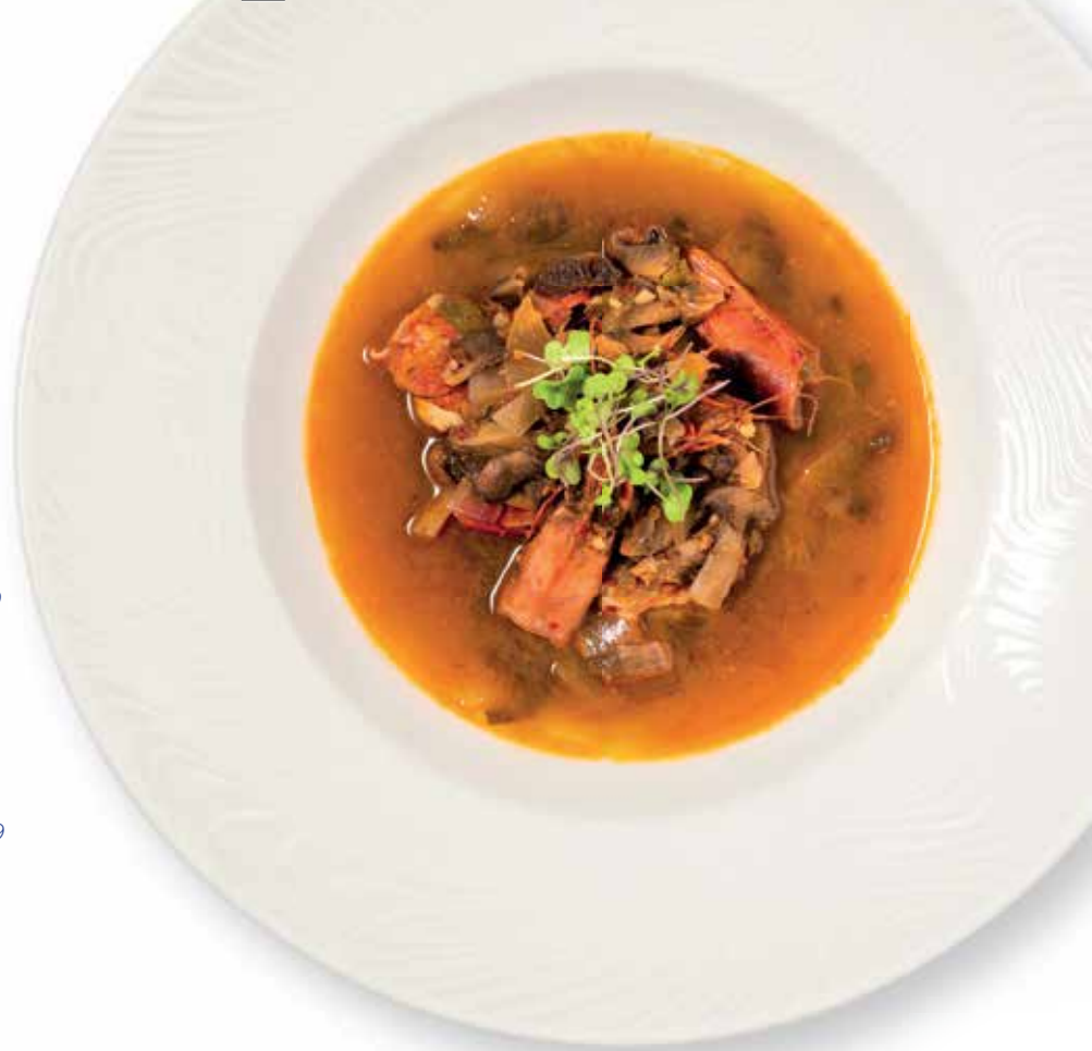
Tom Yum Soup