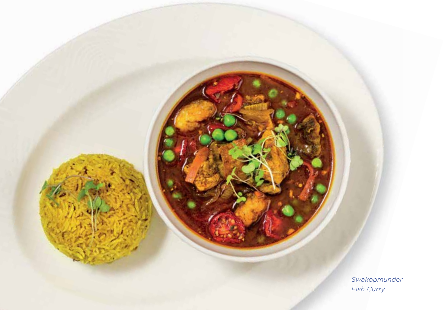
Swakopmunder Fish Curry

homemade curry sauce with pilaf rice 203