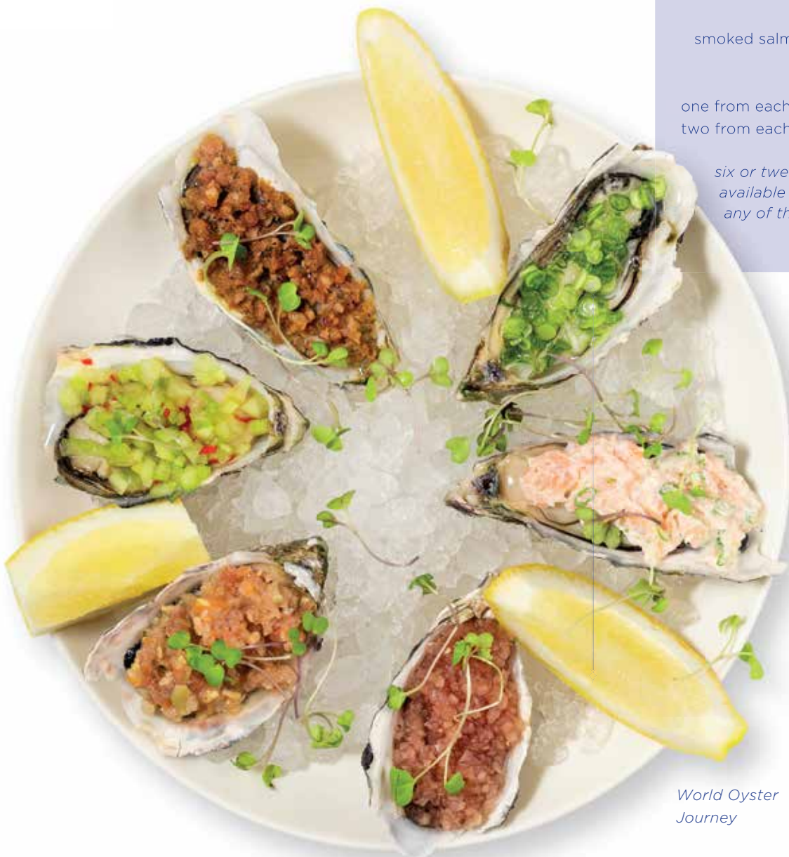
World Oyster Journey

six or twelve oysters are also available in your choice from any of the above countries