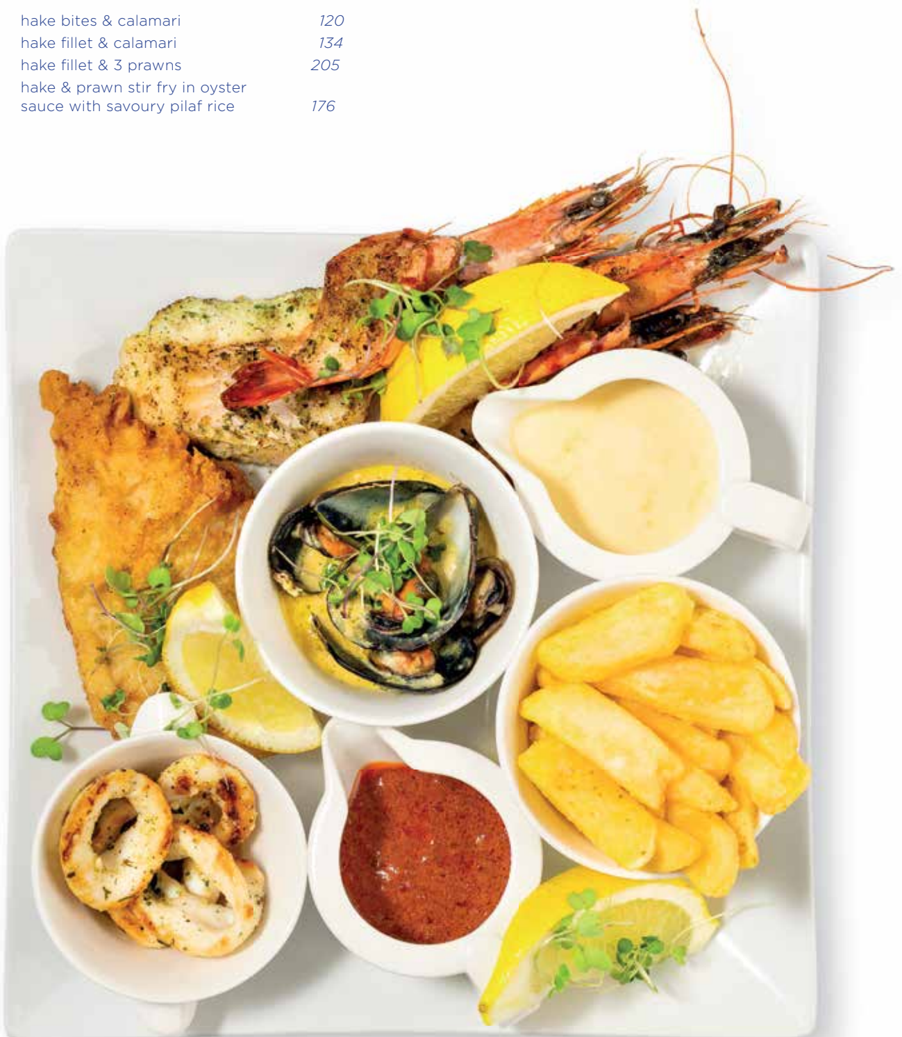
Seafood Platter for one