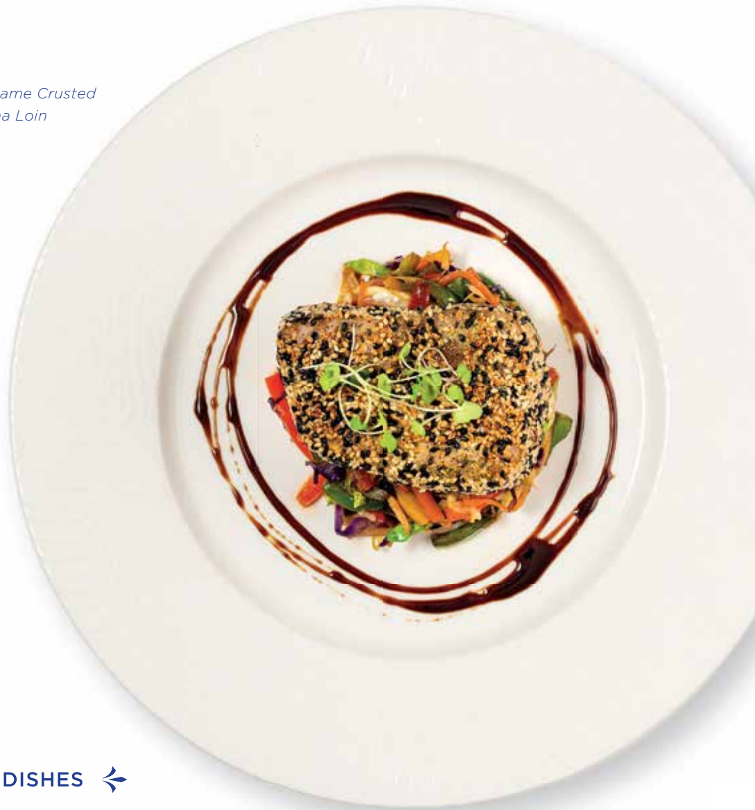
Sesame Crusted Tuna Loin